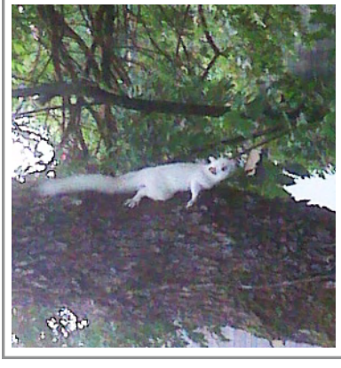
Have you seen the white squirrels? Along the road behind the Big Lake Dam, we have had multiple sightings of 2 white squirrels. Thanks to Amy Benedict, #25, for the snapshot!

This fireworks display is board approved and privately funded for the enjoyment of all property owners. Private use of fireworks of any kind are not allowed at Aspenhof.